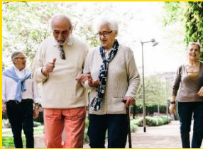
DEMOGRAPHIC GROWTH AND URBANISATION