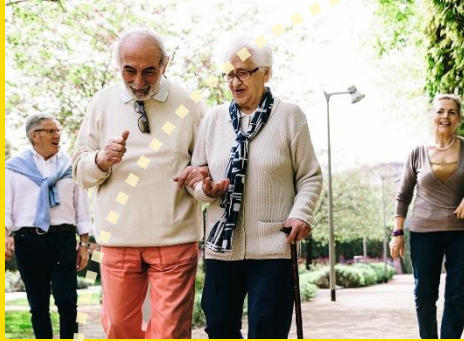
DEMOGRAPHIC GROWTH AND URBANISATION